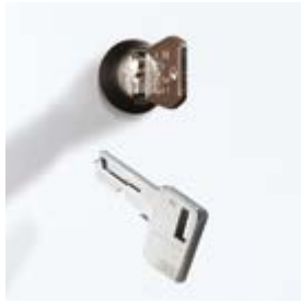
Cylinder lock up to 10,000 key numbers as dimple locks

✓ standard - not available ● optimally suited ◐ suited to some extent ○ less suited