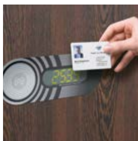
Online transponder lock (with data carrier)