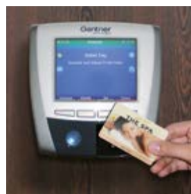
Online transponder lock with integration in building automation