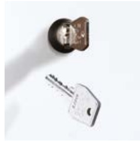
Cylinder lock up to 1000 different key numbers