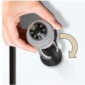
Safety turning bolt latch for padlock