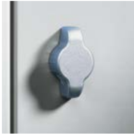
Turning bolt latch for padlock