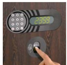
Online lock either PIN-operated or fingerprint-operated