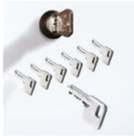
Cylinder lock with master key system (with/without security certificate)