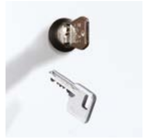
Cylinder lock up to 6,000 different key numbers