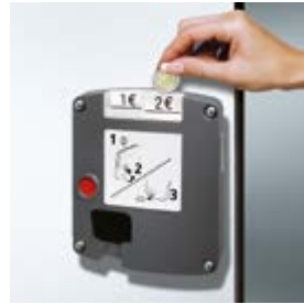
Coin-operated lock as a deposit or token-operated lock