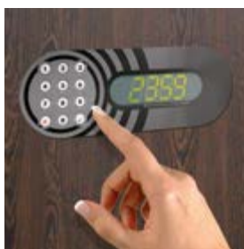
Online PIN code lock